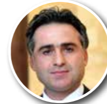
Ali Hamie Minister of Public Works & Transport & Professor & Researcher, Lebanon